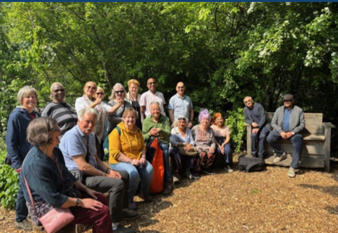
Our members posing for a photo on a Sunday walk!